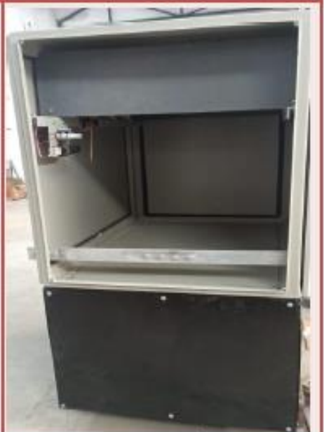
Elect Ctrl Panel - Fabrication