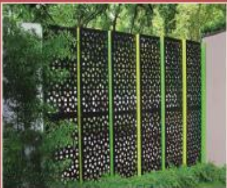
Screen – Sheet Metal Work