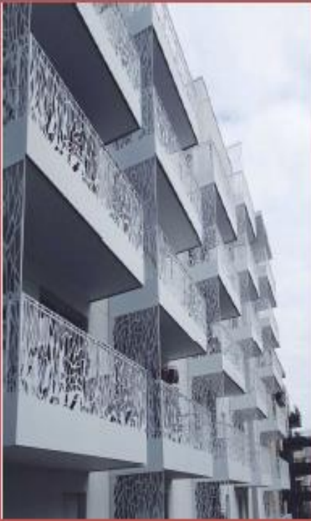
Screen – Sheet Metal Work