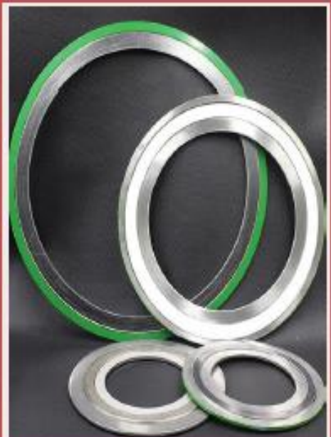
Metallic & Non Metallic Gaskets