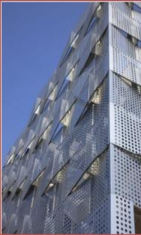
Screen – Sheet Metal Work