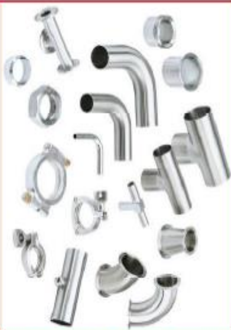
SS, MS, CS, GI Pipes & Fittings