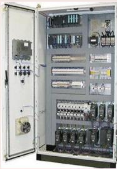
Elect Ctrl Panel - PLC