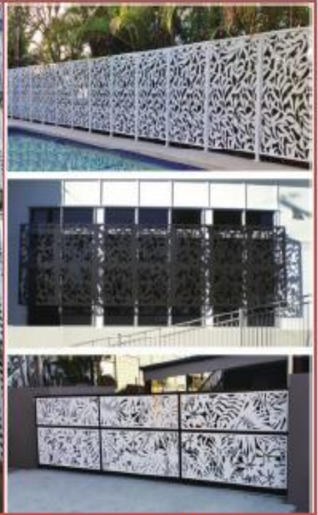
Screen – Sheet Metal Work