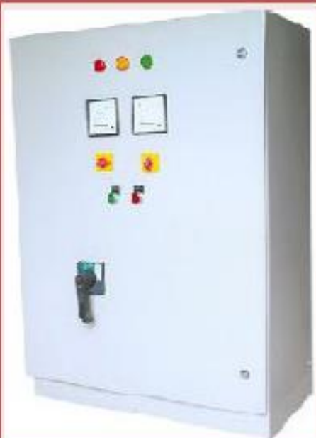
Elect Ctrl Panel - Fabrication