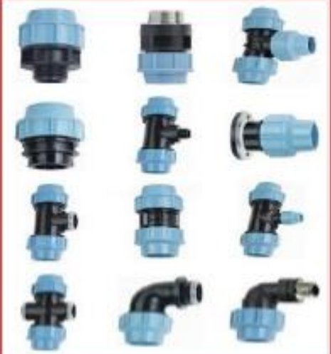
FRP, PP, PU, PVDF, PVC, CPVC, HDPE