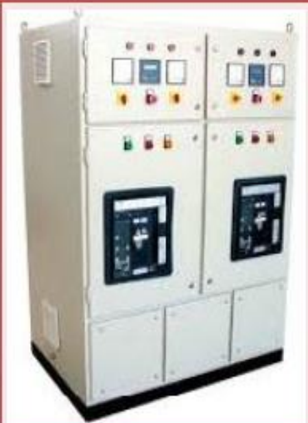
Elect Ctrl Panel – Assembly