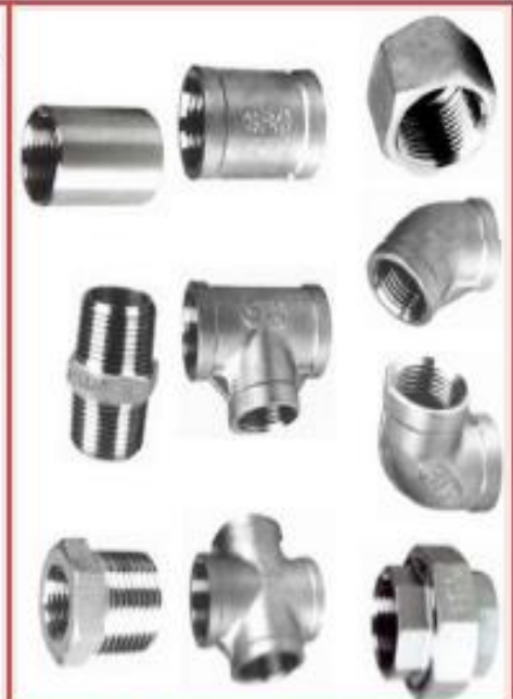
SS, MS, CS, GI Pipes & Fittings