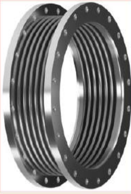
Metal Bellows Expansion Joints