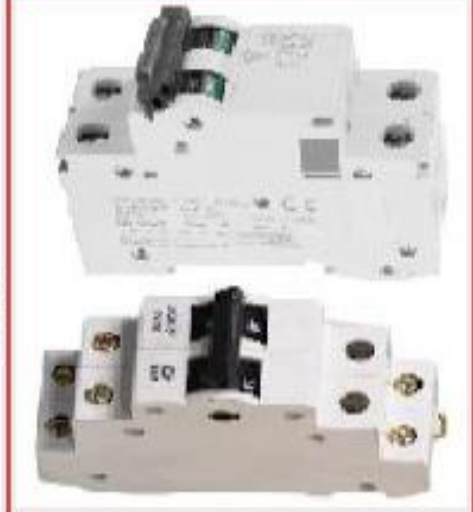
Circuit Breaker / MCB