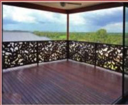
Screen – Sheet Metal Work