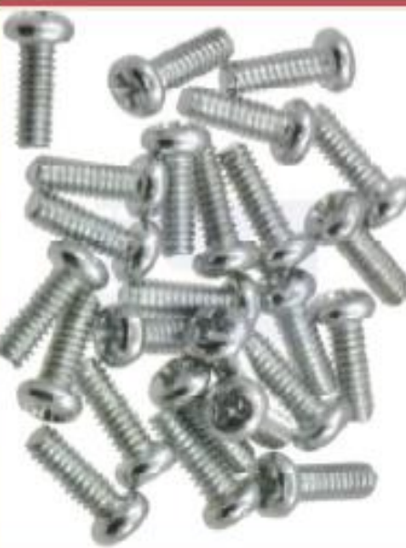
SS, MS, BRASS Fasteners