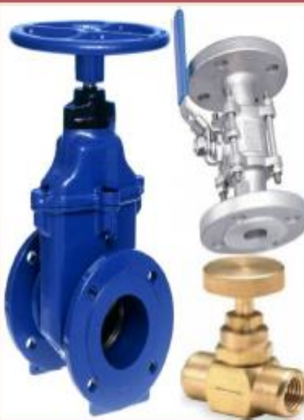
All Types Of Valves