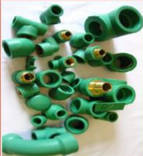
FRP, PP, PU, PVDF, PVC, CPVC, HDPE