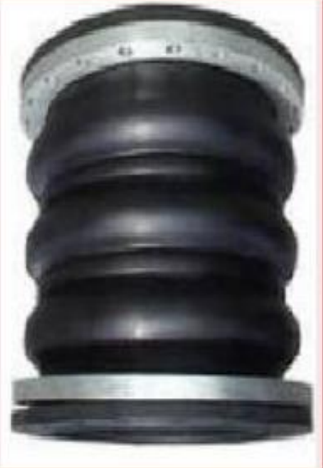
Rubber Bellows Expansion Joints