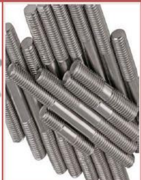
SS, MS, BRASS Fasteners