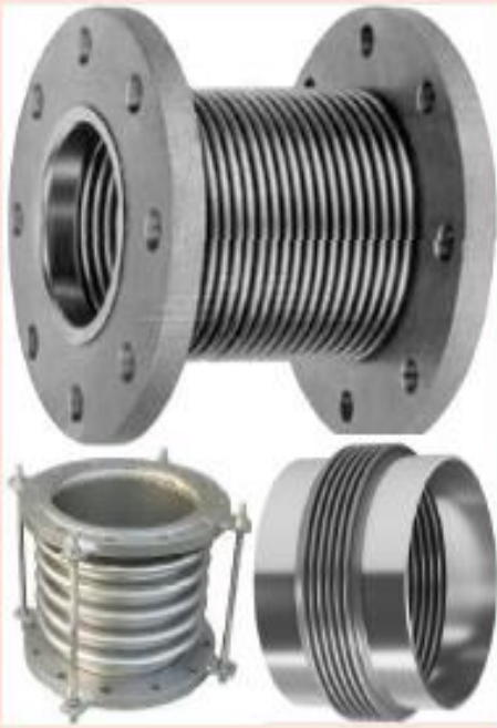
Metal Bellows Expansion Joints