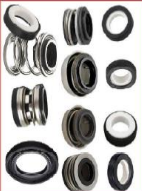
Types Of Seals