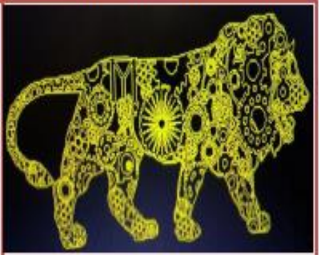
Screen – Sheet Metal Work