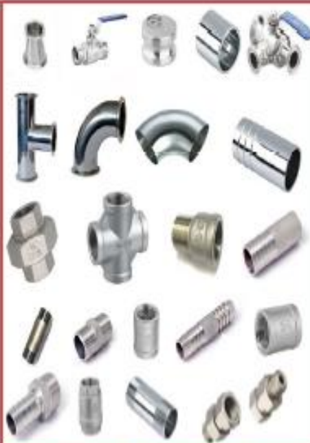
SS, MS, CS, GI Pipes & Fittings