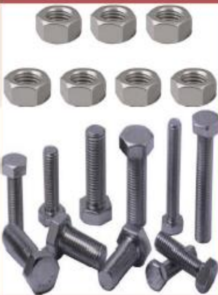
SS, MS, BRASS Fasteners