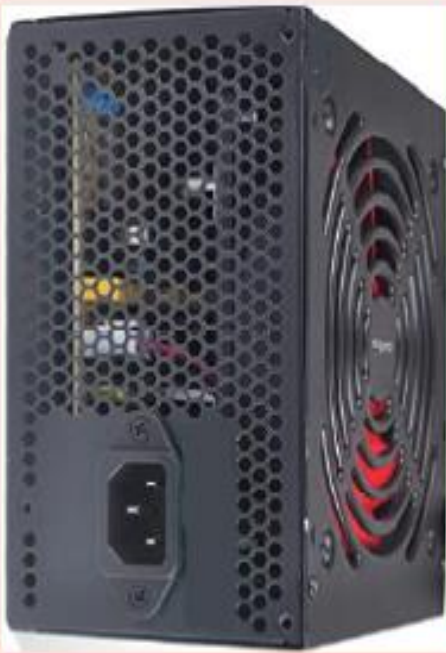
Elect & Electronics - SMPS