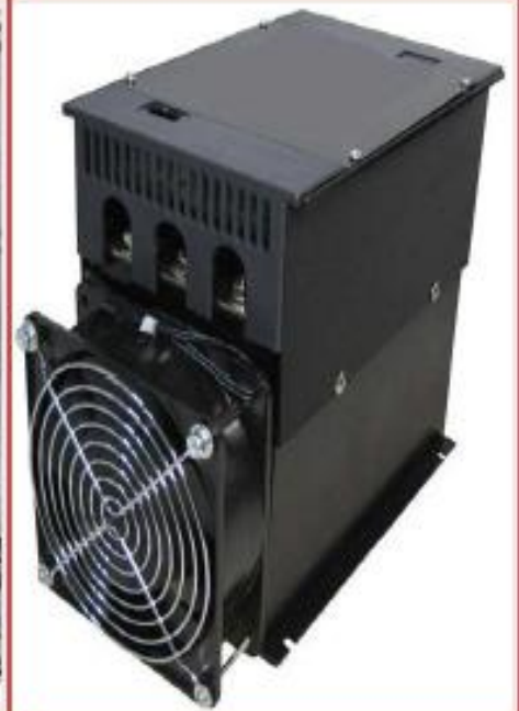
Electric Voltage Regulator