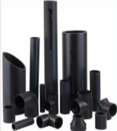
FRP, PP, PU, PVDF, PVC, CPVC, HDPE